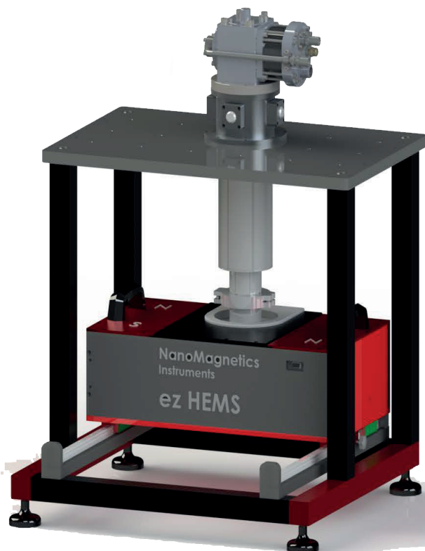
4-300K temperature range with optional cryocooler